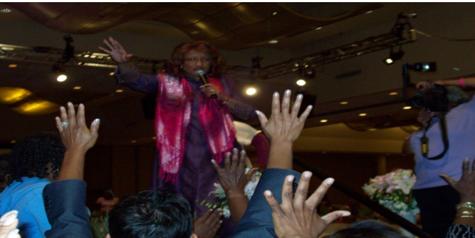
Sisters Keeping the Covenant trip to Toronto, Canada to support an International Women's Prayer Convocation

"Now if you obey me fully and keep my covenant, then out of all nations you will be my treasured possession." Exodus 19:5